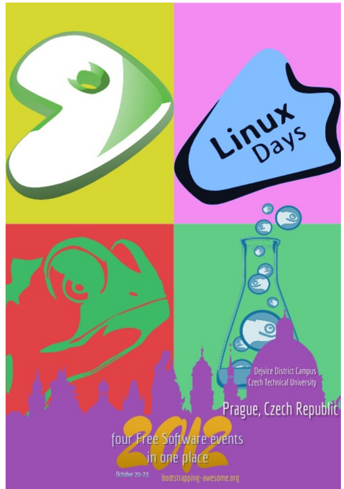
Combined conference poster

Is free and gives you access to all openSUSE sessions