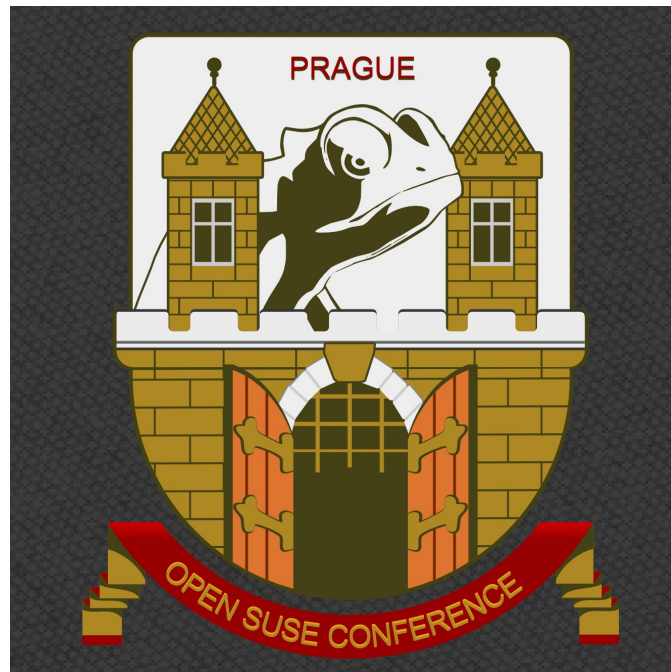
openSUSE Conference 2012 logo